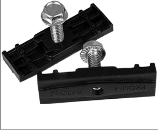
A. Chain Link Fence Hardware