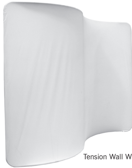
Tension Wall Wave